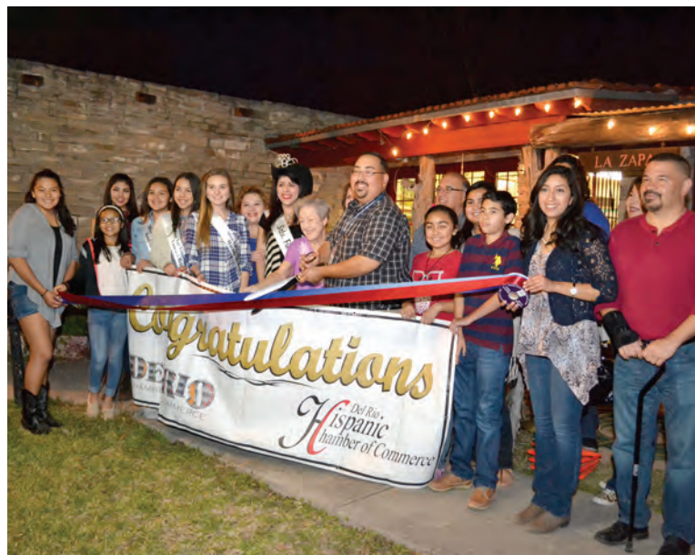
RIBBON CUTTING Whitehead Museum March 4. Rural Texas Women at Work Exhibition