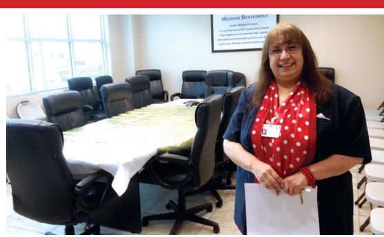
New training room at UMC on Main Street.