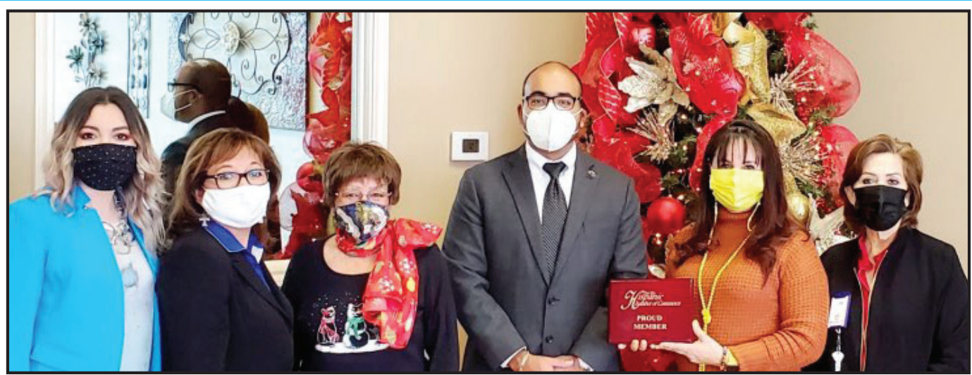
Middle Rio Grande