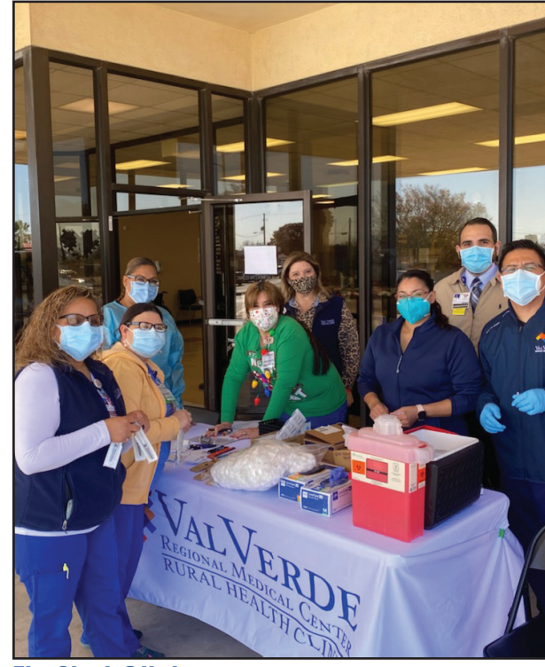
Flu Shot Clinic