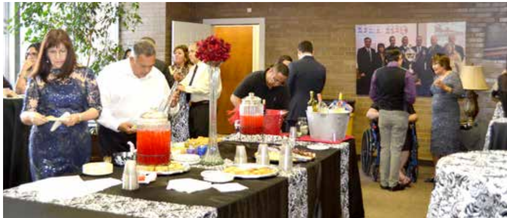
VIP hour Wine and Cheese provided to Sponsors and Scholarship Recipients.