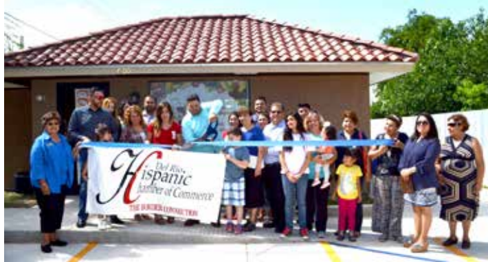
The Solution Ribbon Cutting