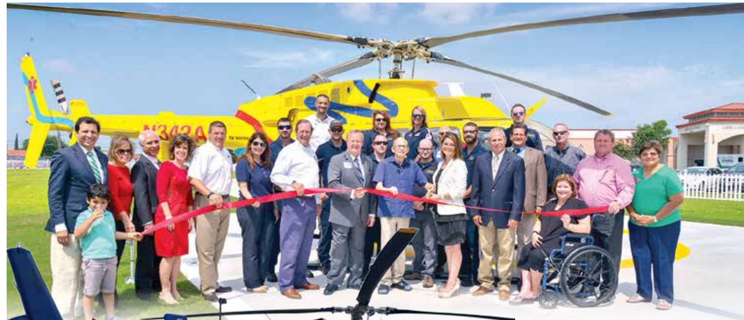
The Del Rio Hispanic Chamber of Commerce joined the Del Rio Chamber Commerce at a special ribbon ceremony to welcome Air Evac Service to Del Rio.